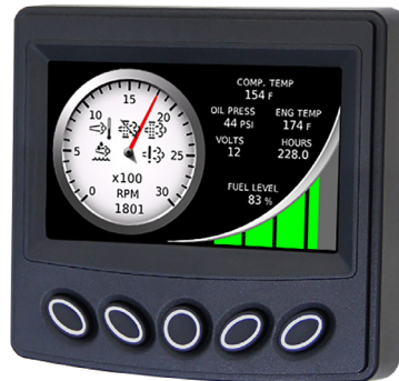
Sullivan-Palatek Electronic Controller (SPEC)