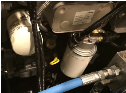
Easy Access fuel filter, oil filter and dipstick