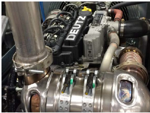
DEUTZ DOC, Diesel Oxidation Catalyst; allows for maintenance free operation