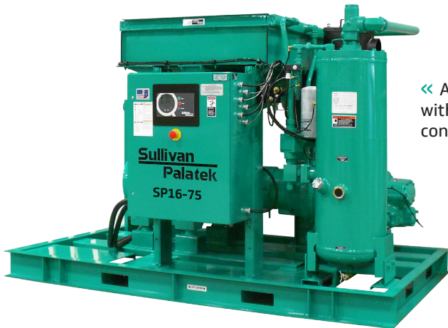
« Air Compressor shown with standard open configuration.